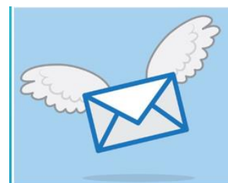
A complete overview on how to manage email accounts after a death, covering all the major providers (Gmail, Yahoo, Microsoft Hotmail and Outlook, Aol, iCloud).