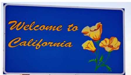
Important health, legal, and end-of-life planning forms and information for people living in The Golden State.